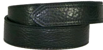
18530 - Black Bison Hook & Loop Tipped