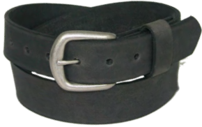
18211 - Black Grey Crazy Trail Satin Finish Buckle • Sewn On