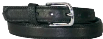
16305 - Black Bison Feather Edge Silver Buckle • Sewn On