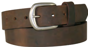
18223 - Aged Bark Chieftain Satin Finish Buckle • Sewn On