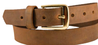
17223 - Aged Bark Chieftain Gold Buckle • Sewn On