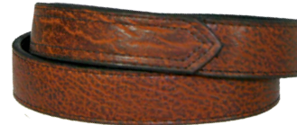
17529 - Full Grain Tucson Bison Hook & Loop Tipped