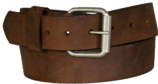
18226 - Aged Bark Chieftain Silver Roller Buckle • Snap Off