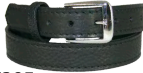
17305 - Black Bison Stitched Edge Silver Buckle • Snap Off