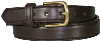
6426-1 Brown Feather Edge Dress Belt Gold Solid Brass Buckle • Sewn On (Durable for concealed carry)