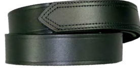
18630 - Black Bridle Hook & Loop Tipped