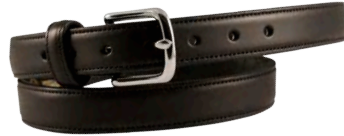
6425-1 Black Feather Edge Dress Belt Silver Solid Brass Buckle • Sewn On (Durable for concealed carry)