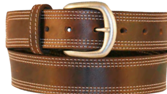
18272 - Brown Latigo Stitched Satin Finish Buckle • Sewn On