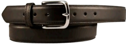
6450-1 - Black Feather Edge Dress Belt Silver Solid Brass Buckle • Sewn On (Durable for concealed carry)