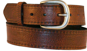
18304 - Dark Pecan Bison Satin Finish Buckle • Snap Off