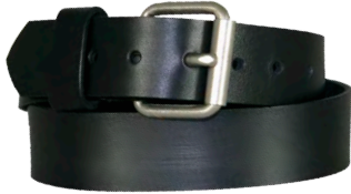
18224 - Black Full Grain Straight Edge Silver Roller Buckle • Snap Off