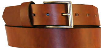
18282 - Oil Tanned Latigo Satin Finish Roller Buckle • Sewn On