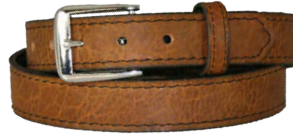
17302 - Tucson Bison Stitched Edge Silver Buckle • Snap Off