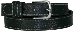
17306 - Black Bison Decorative Stitch Silver Solid Brass Buckle • Sewn On