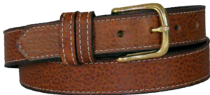
17308 - Tucson Bison Decorative Stitch Gold Solid Brass Buckle • Sewn On