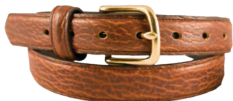
16302 - Tucson Bison Feather Edge Gold Buckle • Sewn On