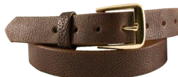
17242 - Brown Milled English Bridle Gold Buckle • Snap Off