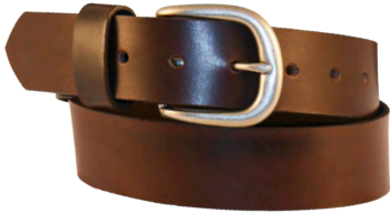
18222 - Brown No Line .75% Loop Satin Finish Buckle • Sewn On