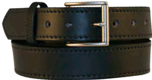
18581 - Black Bridle Satin Finish Roller Buckle • Snap Off