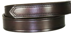
17629 - Full Grain Brown Bridle Hook & Loop Tipped