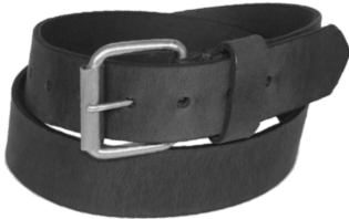
18213 - Black Grey Crazy Trail Satin Finish Roller Buckle • Sewn On