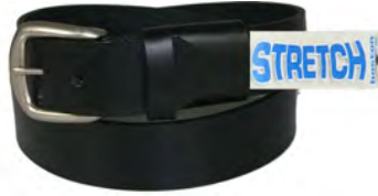
18221E - Black No Line Satin Finish Buckle • Elastic