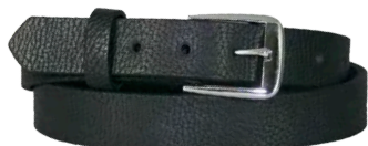
17241 - Black Milled English Bridle Silver Buckle • Snap Off