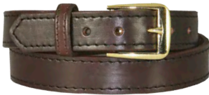
17582- Brown Bridle Stitched Edge Gold Buckle • Snap Off