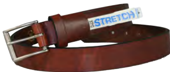
18282E - Oil Tanned Latigo Silver Roller Buckle • Elastic 1 ½" Belt