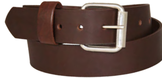
18225 - Brown Full Grain Straight Edge Silver Roller Buckle • Snap Off