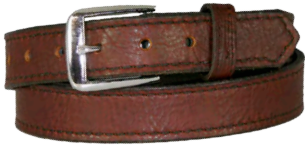
17304 - Dark Pecan Bison Stitched Edge Silver Buckle • Snap Off