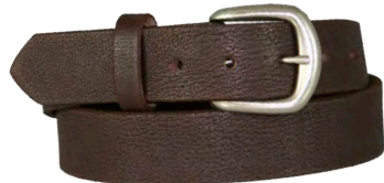
18242 - Brown Milled English Bridle Satin Finish Buckle • Snap Off