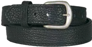
18305 - Black Bison Satin Finish Buckle • Snap Off