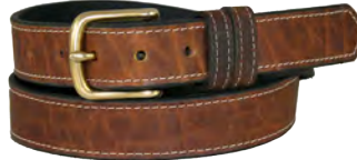
17307 - Dark Pecan Bison Decorative Stitch Gold Solid Brass Buckle • Sewn On