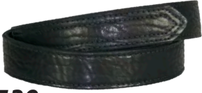
17530- Full Grain Black Bison Hook & Loop Tipped