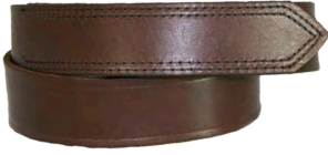
18629 - Brown Bridle Hook & Loop Tipped