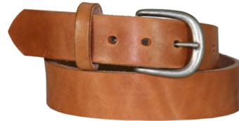
18401 - Beefy Belt Satin Finish Buckle • Chicago Screw (Durable for concealed carry)