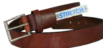
18282E - Oil Tanned Latigo Satin Finish Roller Buckle • Elastic