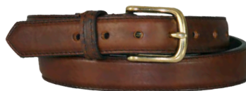
16304 - Dark Pecan Bison Feather Edge Gold Buckle • Sewn On