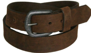
18216 - Brown Rough Rider Bark Antique Buckle • Sewn On