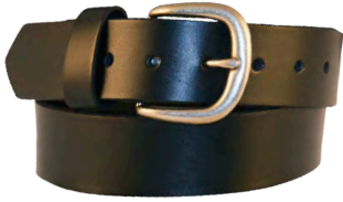
18221 - Black No Line .75" Loop Satin Finish Buckle • Sewn On