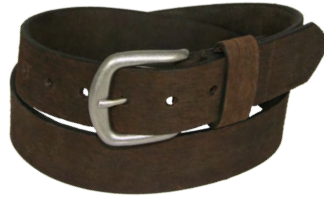
18212 - Brown Rough Rider Bark Satin Finish Buckle • Sewn On