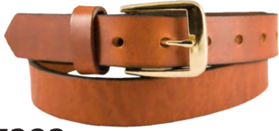
17282 - Oil Tanned Latigo Gold Buckle • Sewn On