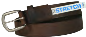
18223E - Aged Bark Chieftain Satin Finish Buckle • Elastic 1 ½" Belt