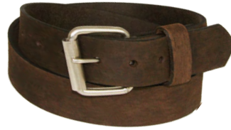
18214 - Brown Rough Rider Bark Satin Finish Roller Buckle • Sewn On