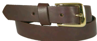
17222 - Brown No Line .75" Loop Gold Buckle • Sewn On