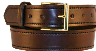
18582 - Brown Bridle Gold Roller Buckle • Snap Off