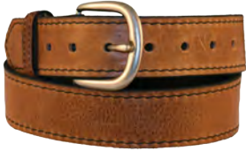
18302 - Tucson Bison Satin Finish Buckle • Snap Off