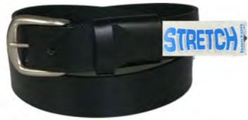
18221E - Black No Line Satin Finish Buckle • Elastic 1 ½" Belt