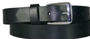
17221 - Black No Line .75" Loop Silver Buckle • Sewn On