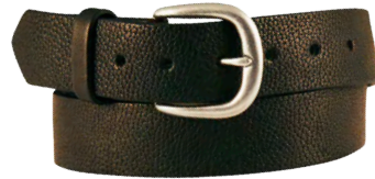
18241 - Black Milled English Bridle Satin Finish Buckle • Snap Off