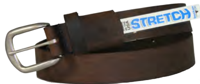
18223E - Aged Bark Chieftain Satin Finish Buckle • Elastic