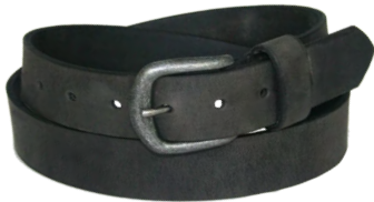
18215 - Black Grey Crazy Trail Antique Buckle • Sewn On