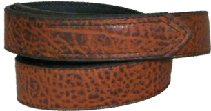
18529 - Tucson Bison Hook & Loop Tipped